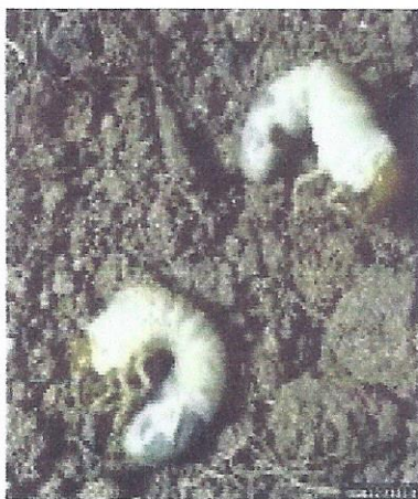
Not to scale

Components : Natural Bucket, Green Funnel, Green Vanes, Green Lid, String, Cap, Cage and pheromone lure.